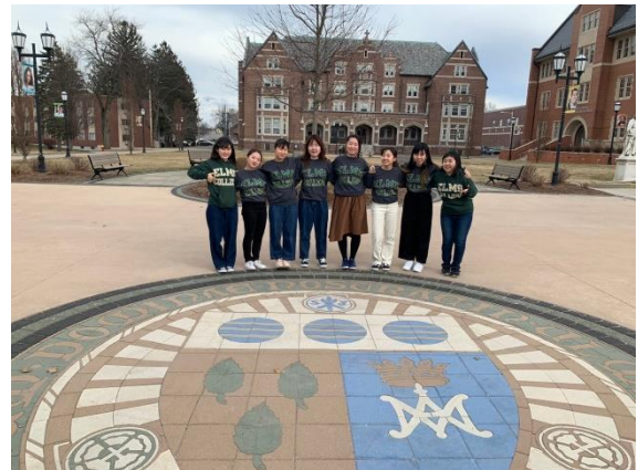
At Elms college