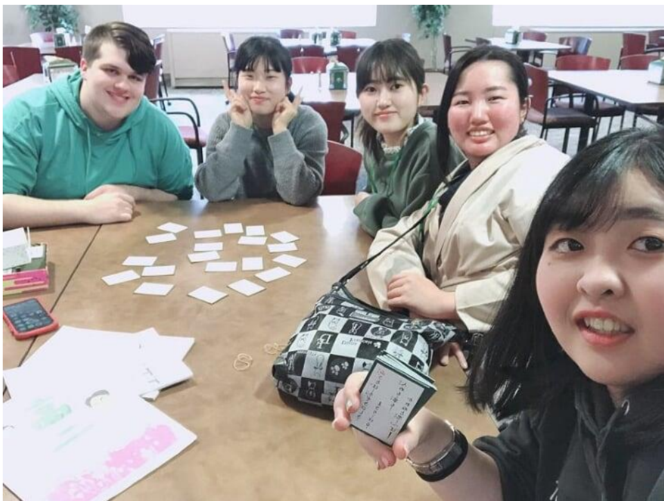
We played a traditional Japanese card game.