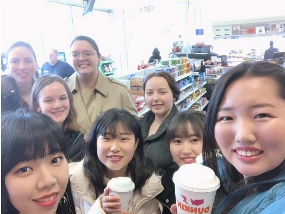
We ate donuts at Dunkin Donut. Dunkin Donut is very popular in America.