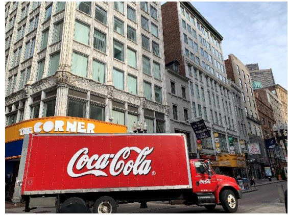
View of Boston