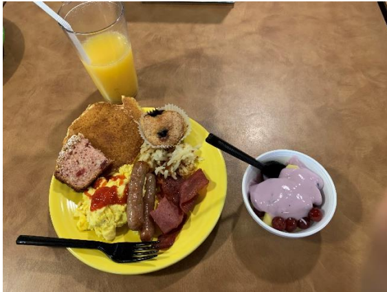
Breakfast at cafeteria