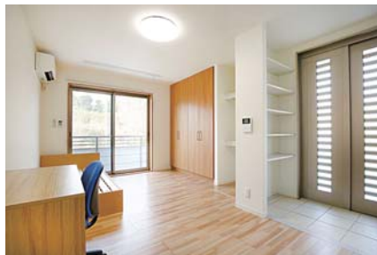
Room for handicapped persons