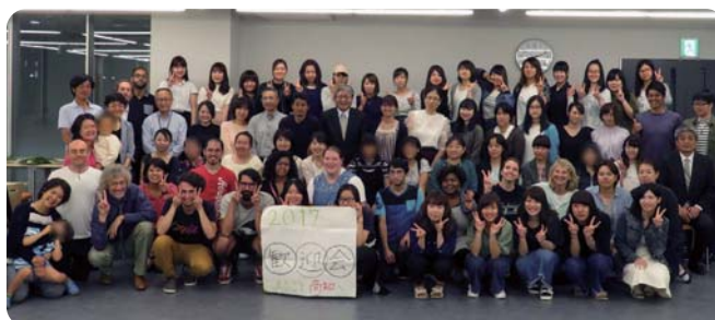
International Student Reception

In addition to normal classes, international students experience contact with nature and various aspects of practical training. Non-international students also participate, furthering their mutual interaction.