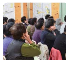
Hands-on seminar "Anti-dementia Calisthenics"

Community-based programs for promoting wellness and longevity