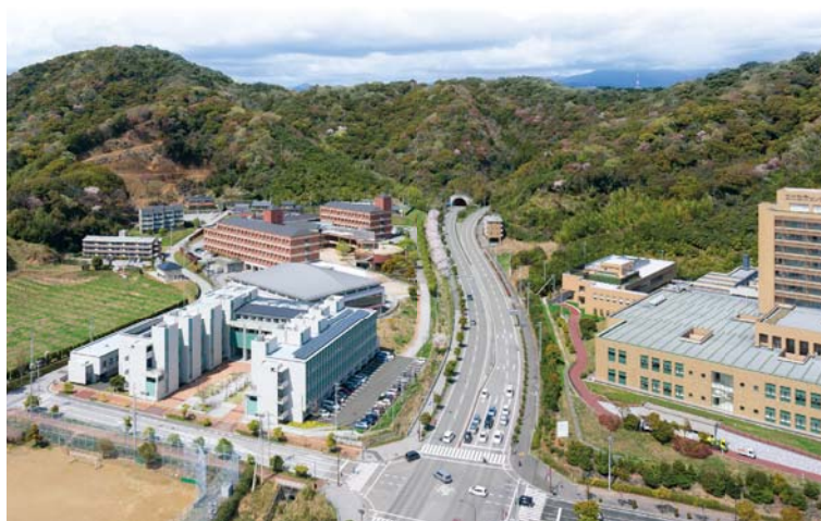
Ike Campus (Left) and the Kochi Health Sciences Center (Right)

Located in the suburbs of Kochi City, the Ike Campus provides an environment in which students can focus on their studies surrounded by nature. Furthermore, we have a comprehensive partnership agreement with the Kochi Health Sciences Center, which sits adjacent to the Ike Campus. The aim of the agreement is to contribute mutually to the further advancement of education and research and the development of the local community.