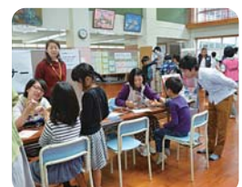
Misato Fair "Know Your Body"