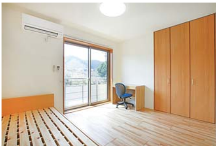
Individual space in a 4-resident dorm