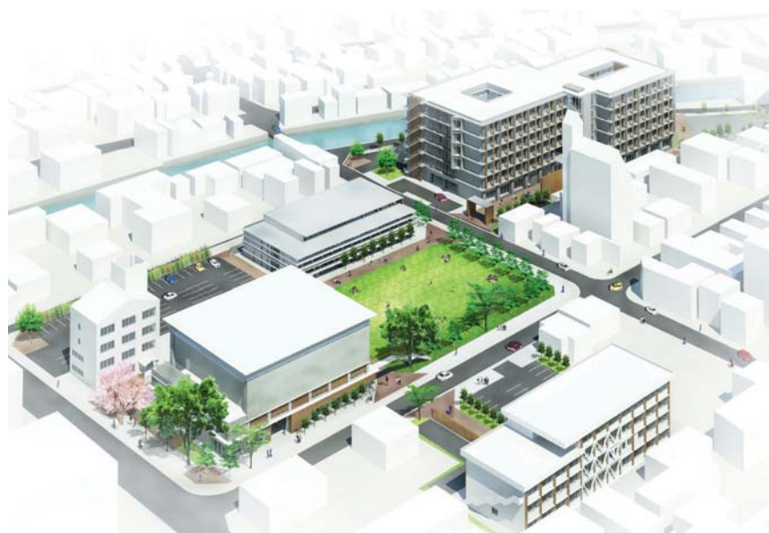
Overall Image of the Campus