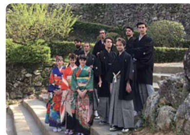
Japanese Culture Experience

In addition to normal classes, international students experience contact with nature and various aspects of practical training. Non-international students also participate, furthering their mutual interaction.