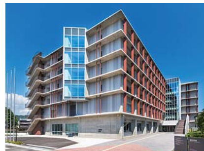
The Education and Research Building

The Education and Research Building was completed in March 2015. In addition, the library, gymnasium, and student cafeteria were newly constructed in March 2017, and students have begun learning with pride on an open campus that is also easy for prefectural residents to get to know. Further, response to natural disasters has also been taken into consideration to give nearby residents a place to take shelter in the event of a disaster.