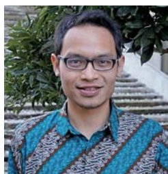
Graduate School of Nursing Disaster Nursing Global Leader major Doctoral program