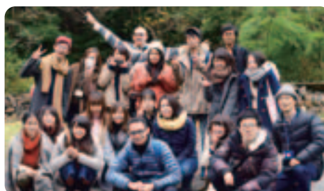
Kuroson River Water Park