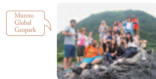
Muroto Global Geopark